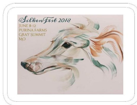
Sublimated Patch (4 x 3)